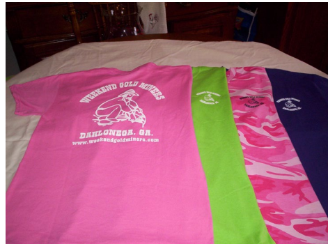
Ladies Shirt Colors: Pink, Green, Purple and Pink Camo. Sizes: Small, Med., Large, X-Large and 2X. Ladies shirts do not have a pocket.

These are the new WEGM T-shirts for the men and ladies. All shirts are $10.00 ea. There will be a $6.50 shipping and handling charge for each shirt. If you want to place an order please state the color and size of shirt and how many. Send your order to: T-Shirt Order. P.O. Box 910, Dahlonega, Ga. 30533. Make check or money order to Weekend Gold Miners Club.