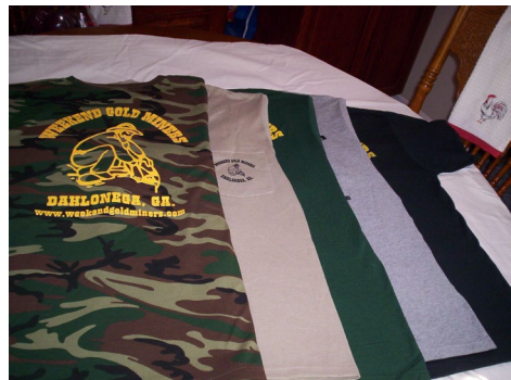
Mens Shirt Colors: Black, Tan, Grey, Hunter Green, Camo Sizes: Small, Med., Large, X-Large, 2X. Camo shirts do not have a pocket.